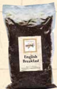
BULK TEAS 2 LB. BAG WITH LOOSE TEA